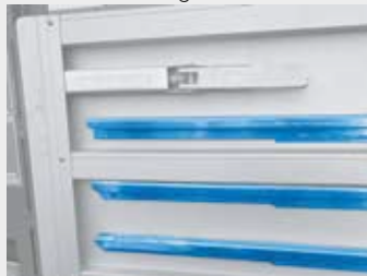
Sideboards with curtain hooking levels